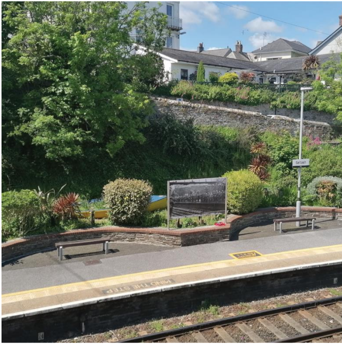
Figure 1 - Area marked on map as 1