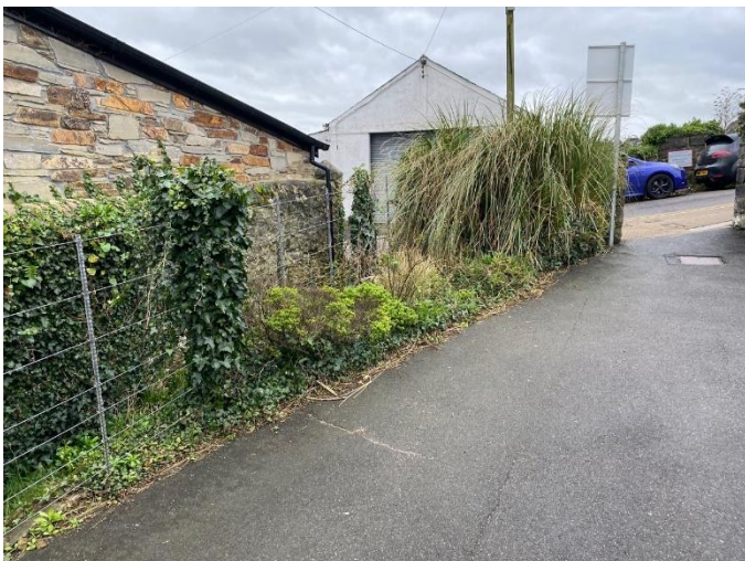
Figure 5 Area marked 4 on the map