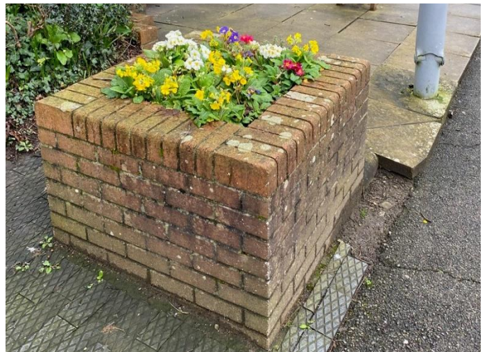
Figure 4 Area marked 3 on the map