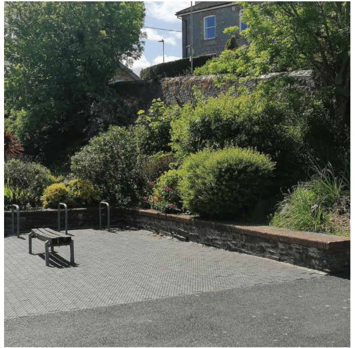
Figure 2 Area marked on map as 1