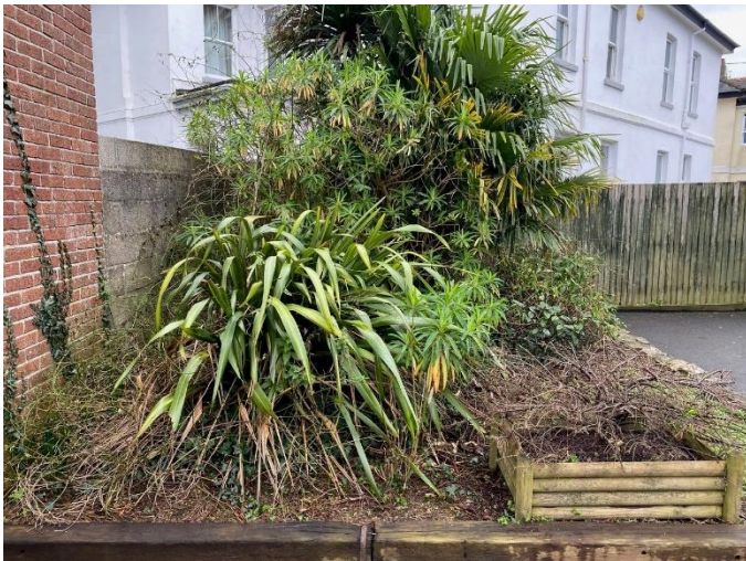
Figure 3 Area marked 2 on the map